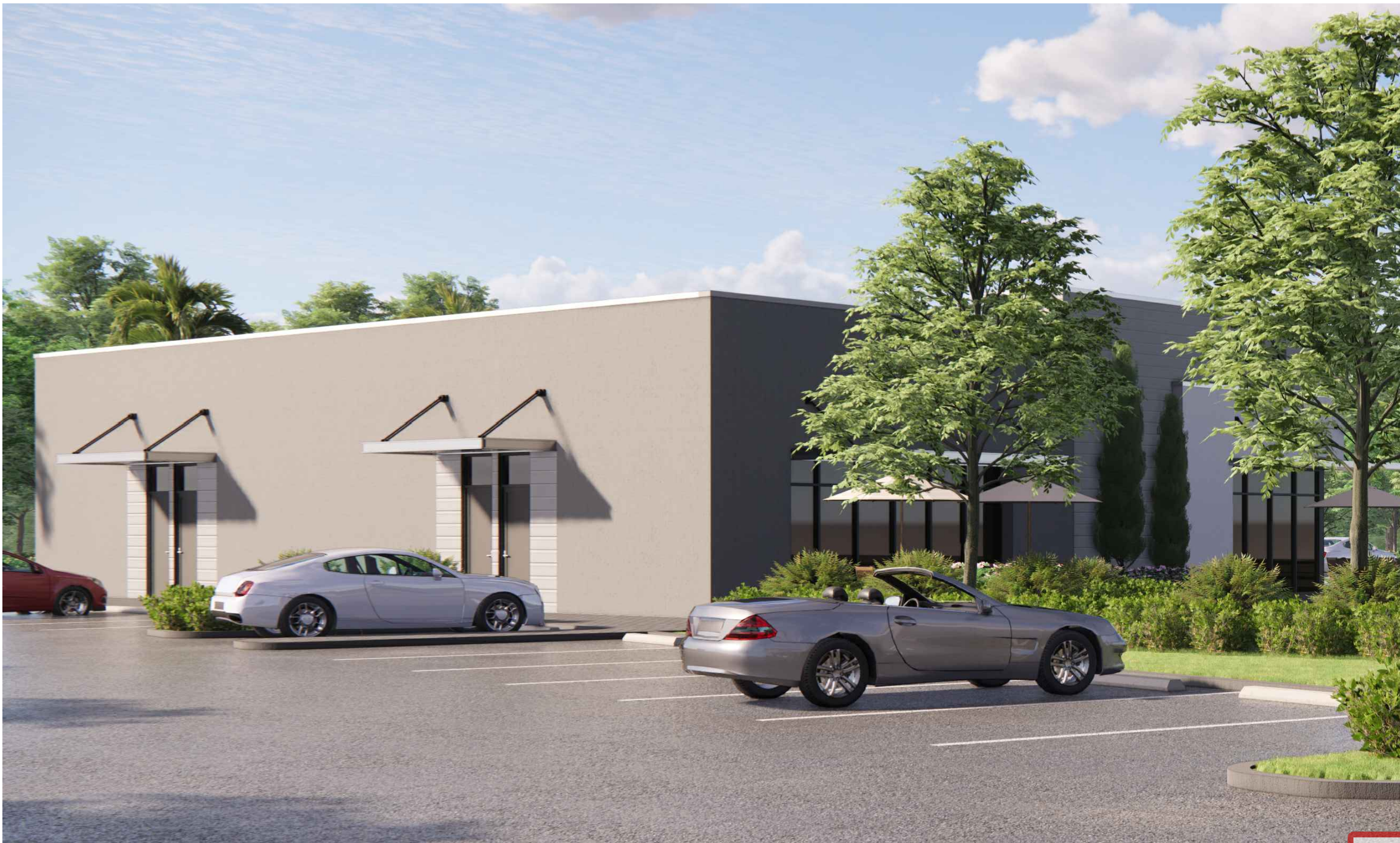
SOUTHWEST PROPOSED VIEW