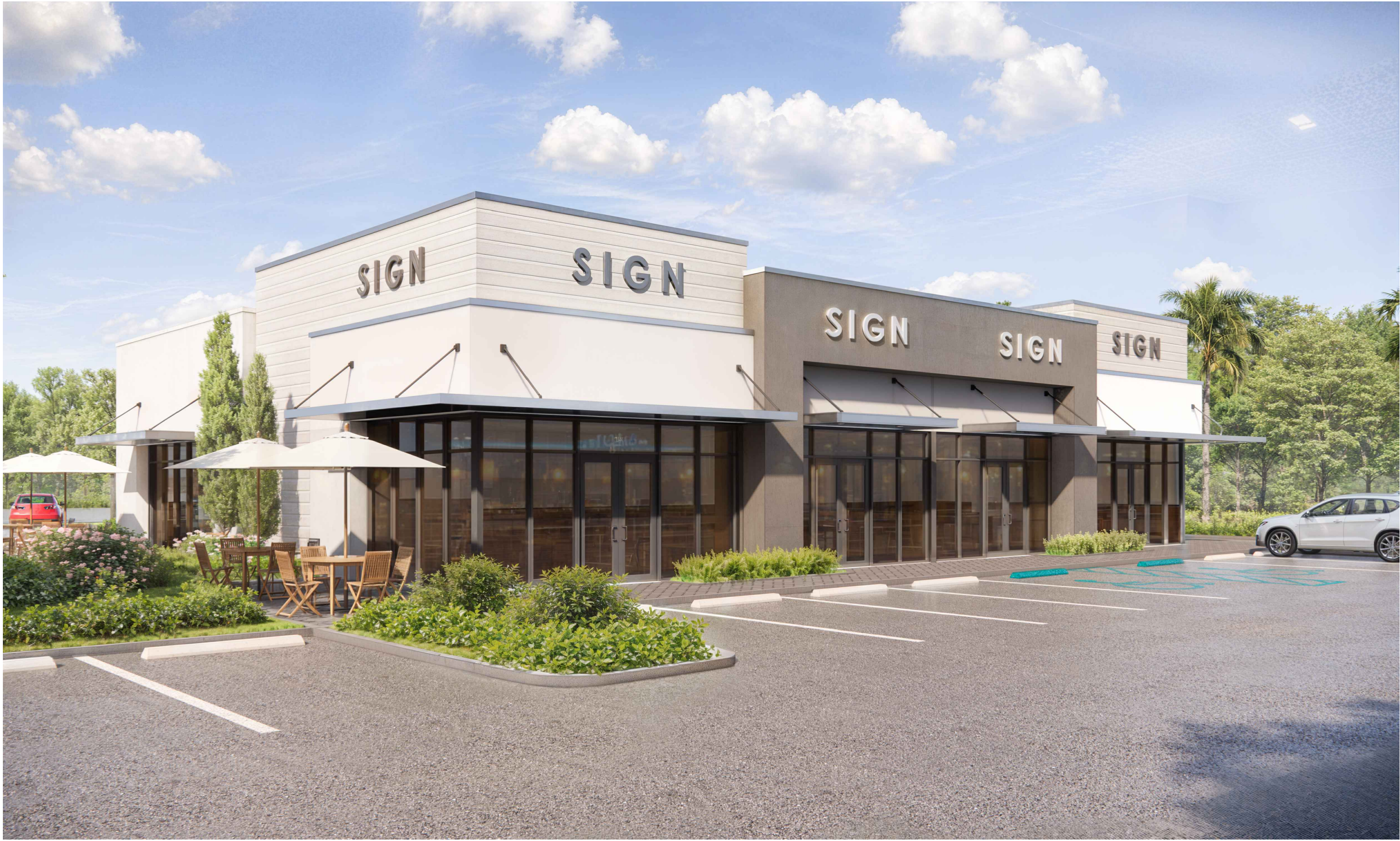
NORTHWEST PROPOSED VIEW