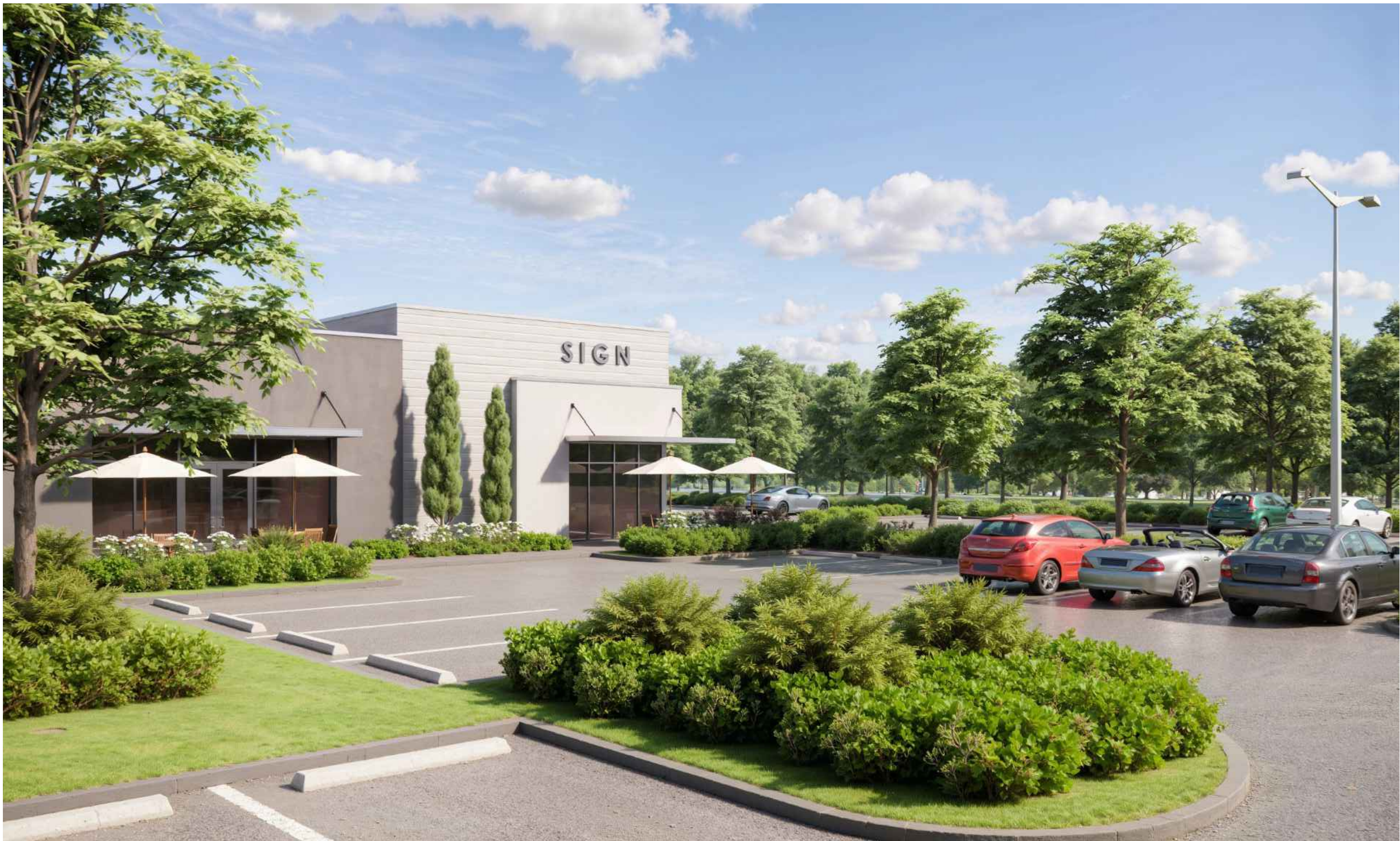
SOUTHWEST PROPOSED VIEW