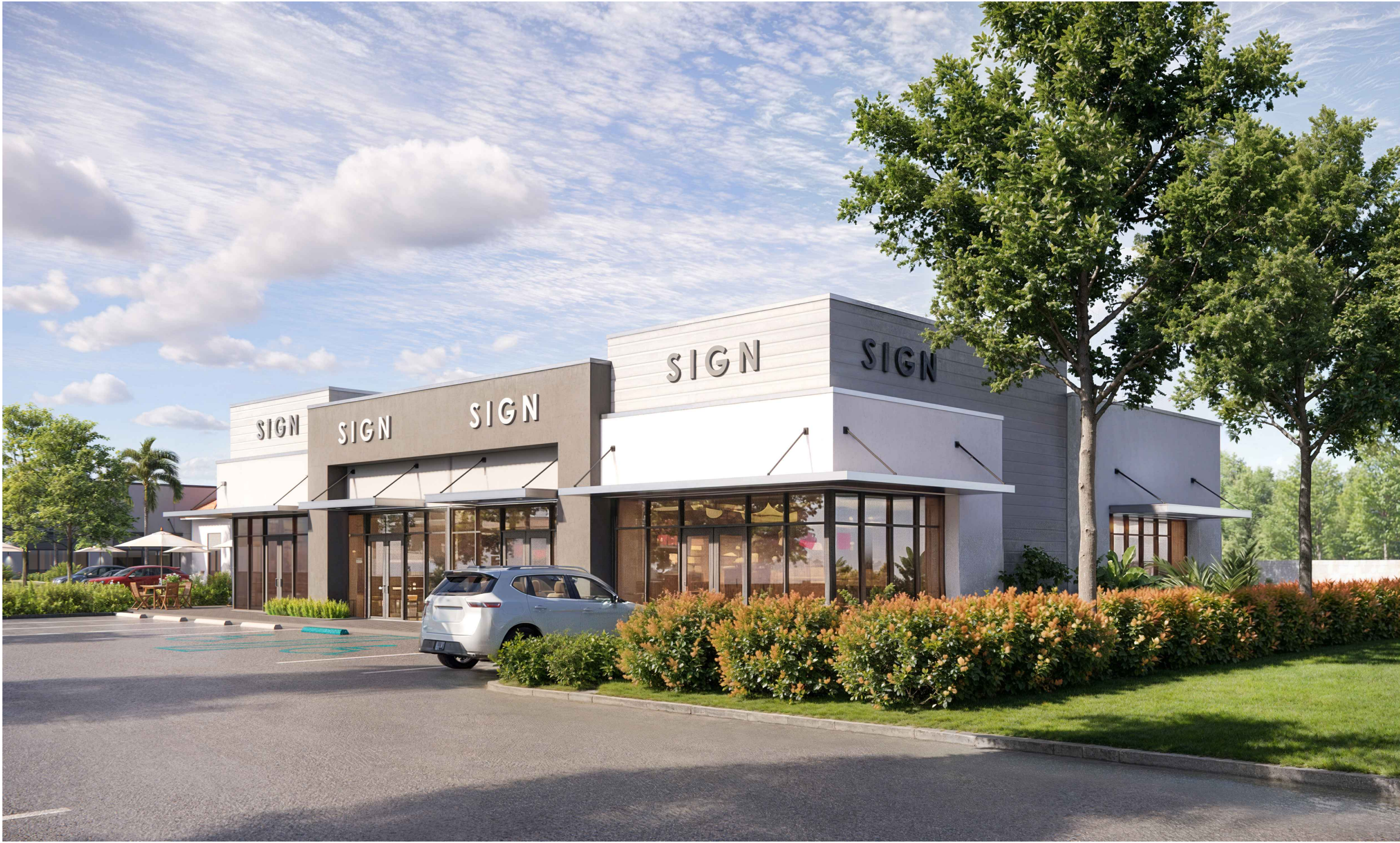
NORTHEAST PROPOSED VIEW